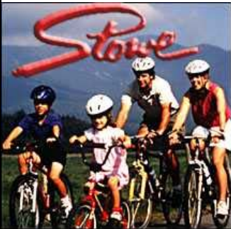
Stowe, Vermont Recreation Path

Leaving automobiles behind, we will now ramble along some of the best hike and bike trails in America. Our first stop is a personal favorite, the Stowe, Vermont Recreational Trail. This 5.3 mile beauty offers spectacular views of the Green Mountains as it meanders, crossing the West Branch River 11 times on its way to Stowe Village. The route is dotted with swimming holes, too, for a refreshing dip.